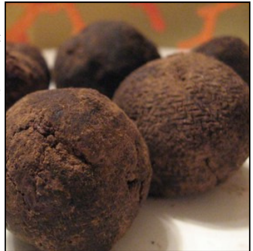
Chocolaty goodness — shortbread truffles

In a double boiler, combine the chocolate and butter together and melt together, then stir in the shortbread crumbs and whisky and combine thoroughly. Transfer mixture to a shallow bowl and leave to