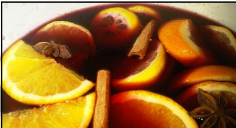
A seasonal favorite — mulled wine