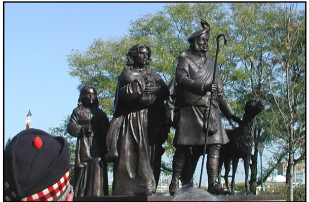
The completed monument has exceeded all expectations.

The four figures and a dog on the monument are somewhat larger than life-size and stand on a granite base four feet high, 6 feet long and 6 feet deep. There are two bas-relief plaques on the base depicting the contributions that Scots have made to Philadelphia