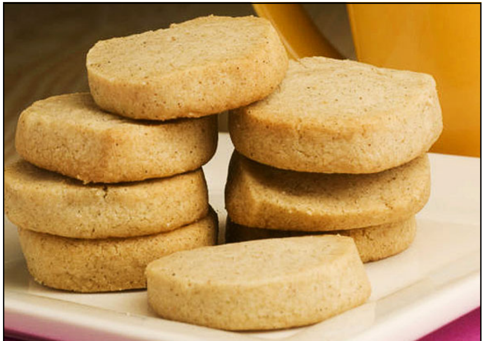
Delicious and melts in your mouth: burrebrede

A Blythe Yule an' a Guid Hogmanay tae ye an' yer kin!