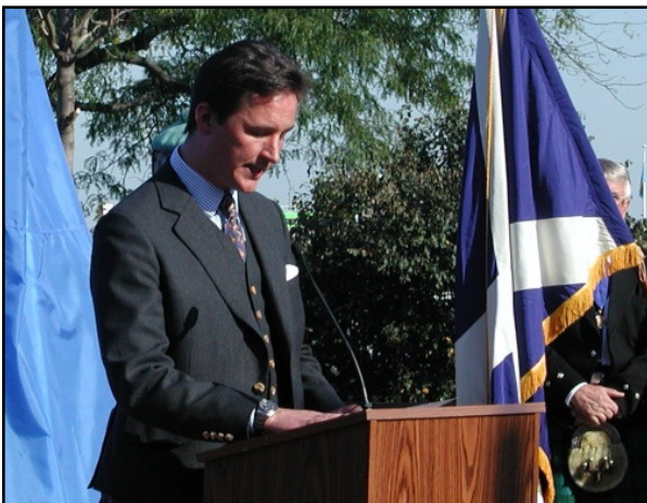
His Grace Torquil Campbell, 13th Duke of Argyll

All in all, this monument is something in which all Scottish America can be proud!