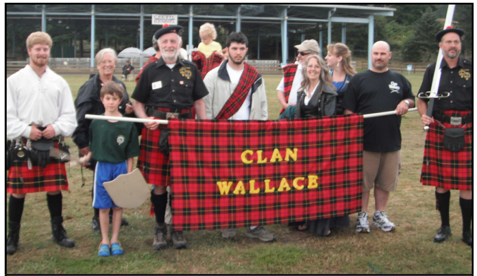
Waiting for the parade to begin at Enumclaw

In other games members, and non-members participate in the march. In fact, that is a very good way to get people interested in joining. When convening, we bring along an extra Wallace Tartan or shirts so they can be used in the Clan Parade. It is a way to show we care about having visitors in the parade with us.