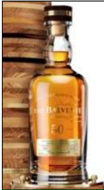
Balvenie Fifty: a scotch worth its weight in gold

Before tasting the aptly named The Balvenie Fifty, we savored The Balvenie 12-year-old DoubleWood and 17-year-old DoubleWood. We found the former, which spent twelve years in a used American oak bourbon barrel before mellowing for a few months in a European oak sherry barrel, to be playful and honeyed, with hints of vanilla from its first home and cinnamon spice from its second. The 17-year had a