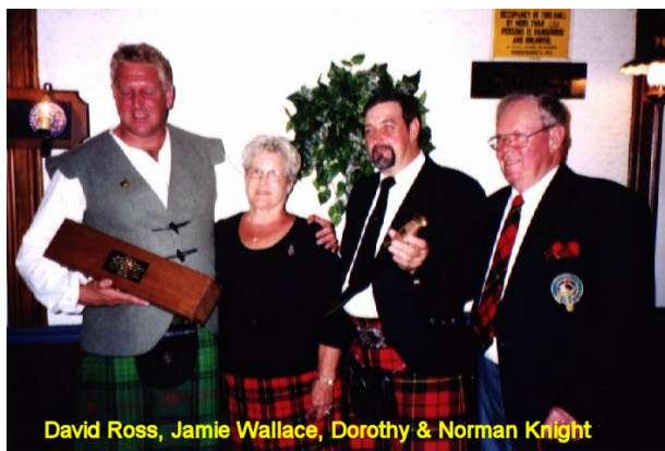
Presentations at the Wallace Banquet