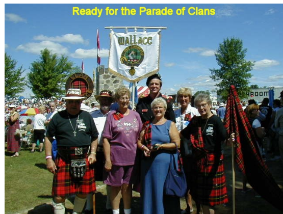
At The Fergus Games